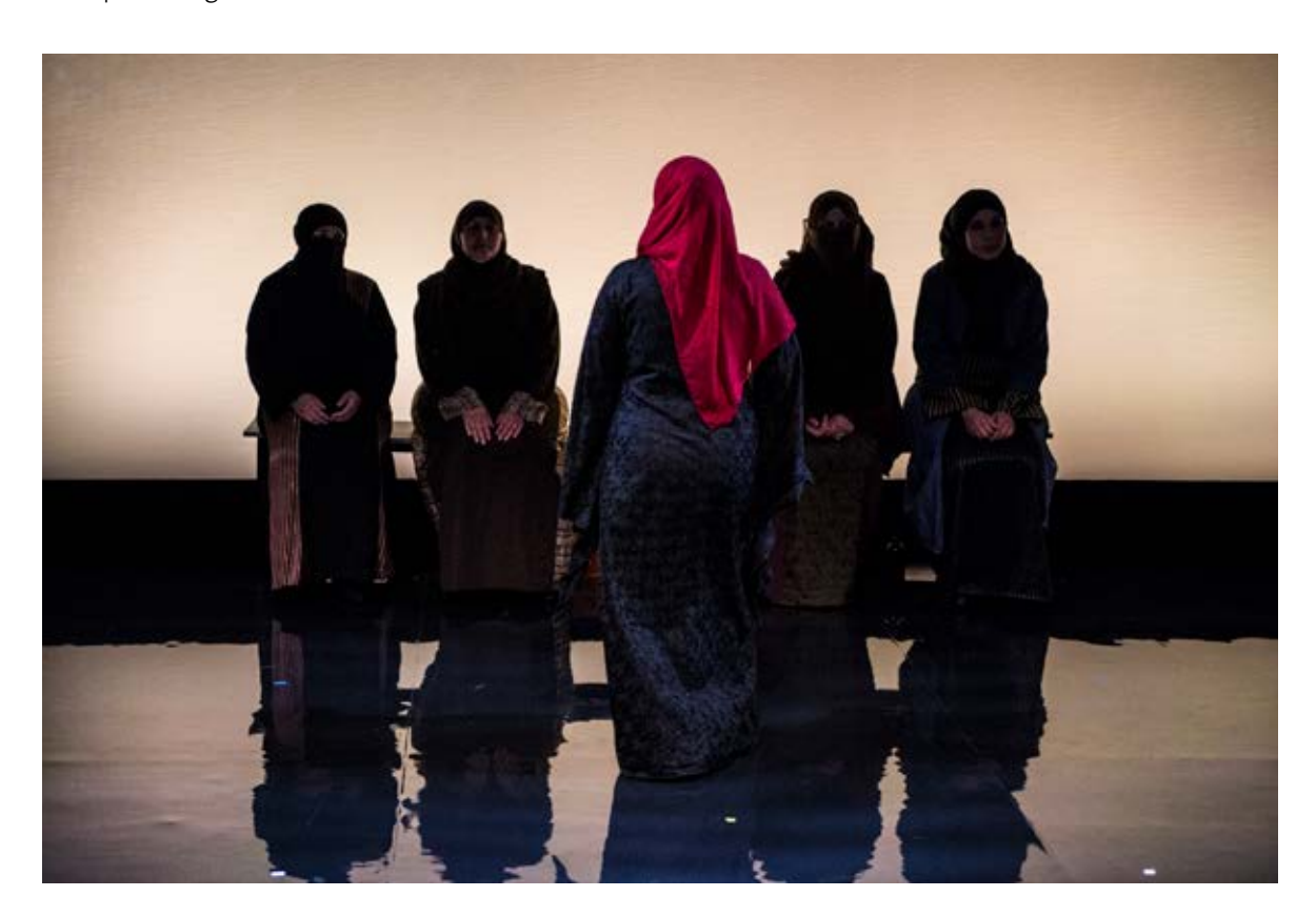
Syrian refugees performing at the New London Theatre in the new Queens of Syria Tour 2016 supported by UN Women.

The introduction of parliamentary gender quotas by 14 Arab countries<sup>77</sup> has contributed, in part, to these improved numbers. However, as global evidence highlights, gender quotas in and of themselves do not guarantee women's meaningful influence, or necessarily indicate women's political power or authority in the region. Manipulation of women's participation for the purposes of party politics or military purposes continues to alienate women from political activities that they do not consider to be democratic or representative.<sup>78</sup> Further, where gender quotas are badly designed, they can also be subverted by power-holders to extend their own control by selecting loyal or 'proxy' women to fulfil these positions.<sup>79</sup>