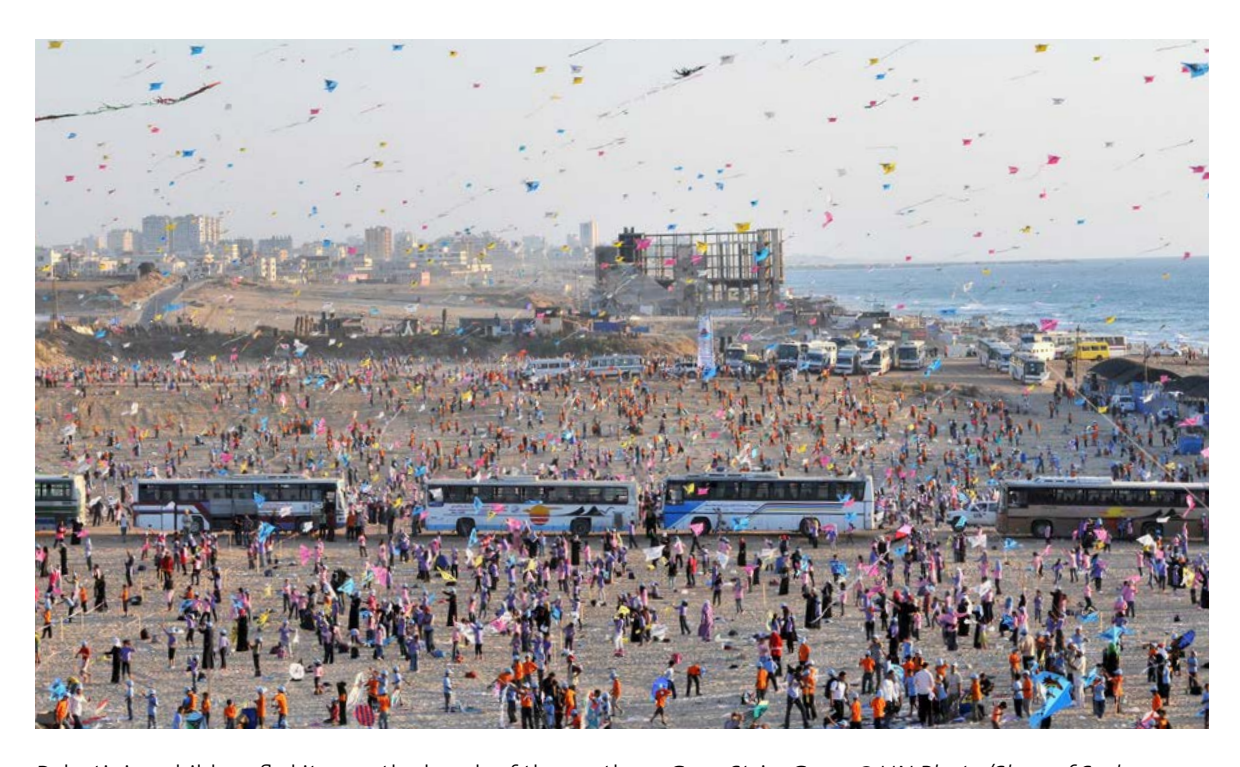
Palestinian children fly kites on the beach of the northern Gaza Strip, Gaza.

"There is a lack of mechanisms to apply 1325, as well as a lack of disciplinary actions to guarantee the commitment of different parties to the resolution" (Palestinian researcher, Gaza)