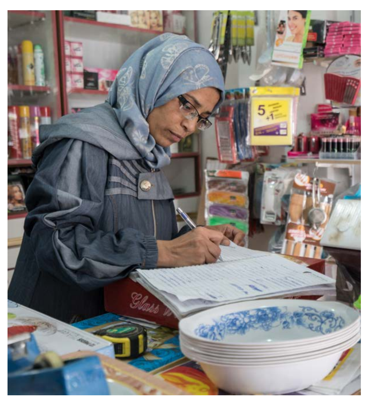
UN Women beneficiary, running small business. Zarqa, Jordan.

ability to influence and lead in these spaces once they have access.