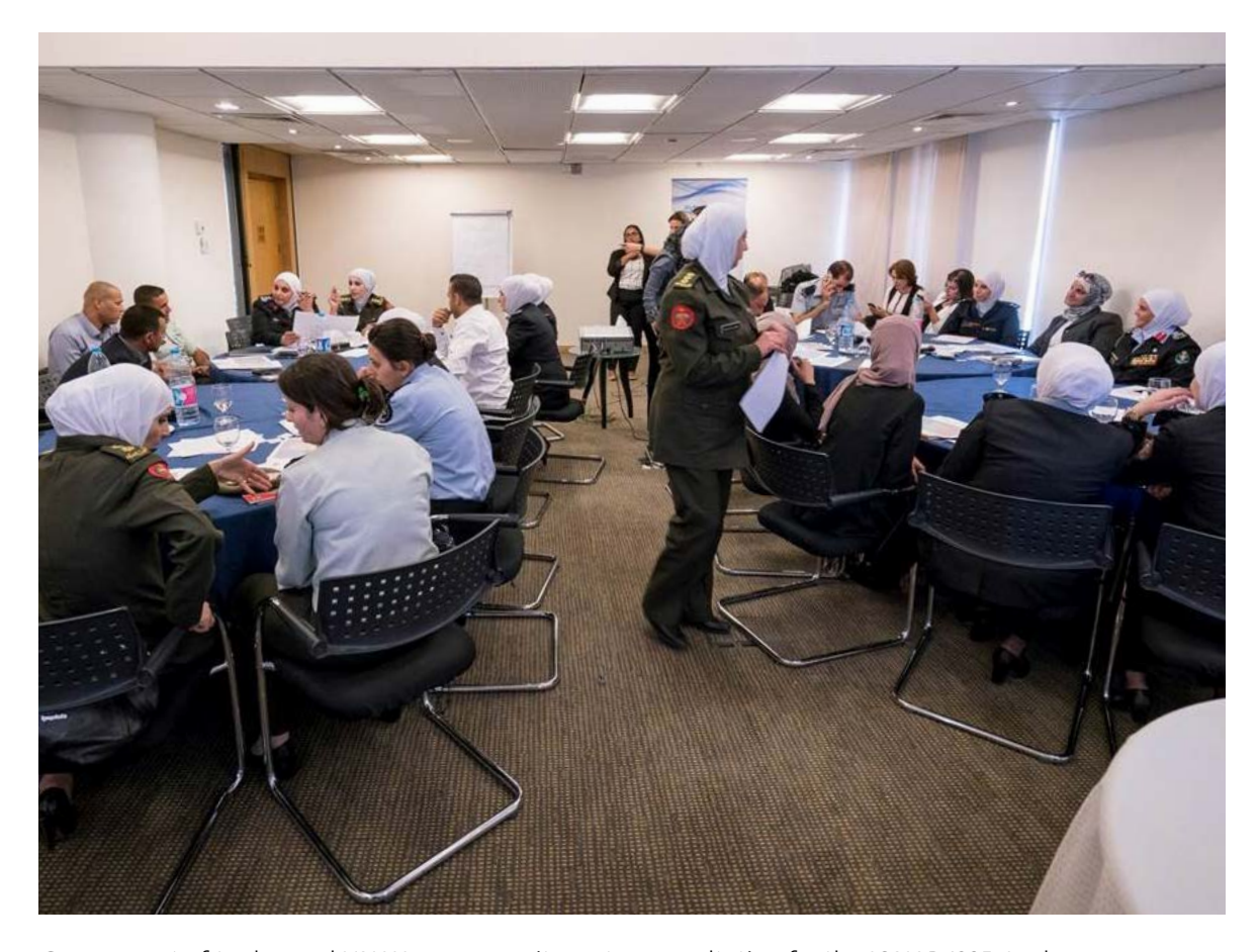
Government of Jordan and UN Women security sector consultation for the JONAP 1325, Jordan.

While the passing of NAPs represents an important achievement in itself, their implementation in the region has "proven difficult, largely due to insufficient political will, a dearth of governmental leadership and buy-in, and a lack of necessary and targeted resources", as discussed further under the challenges section of this report.<sup>17</sup> This is in spite of the fact that national women's machineries within government structures across the region have played a key role in supporting the implementation of NAPs and broader WPS related activities – particularly in Jordan, Tunisia, Iraq and Palestine.<sup>18</sup> However, as evidence highlights, the "effectiveness of national machineries is entwined with the strength and legitimacy of state institutions that enact these rights and uphold the rule of law. Therefore, if overall state institutions are weak, then so will be gender machineries".19