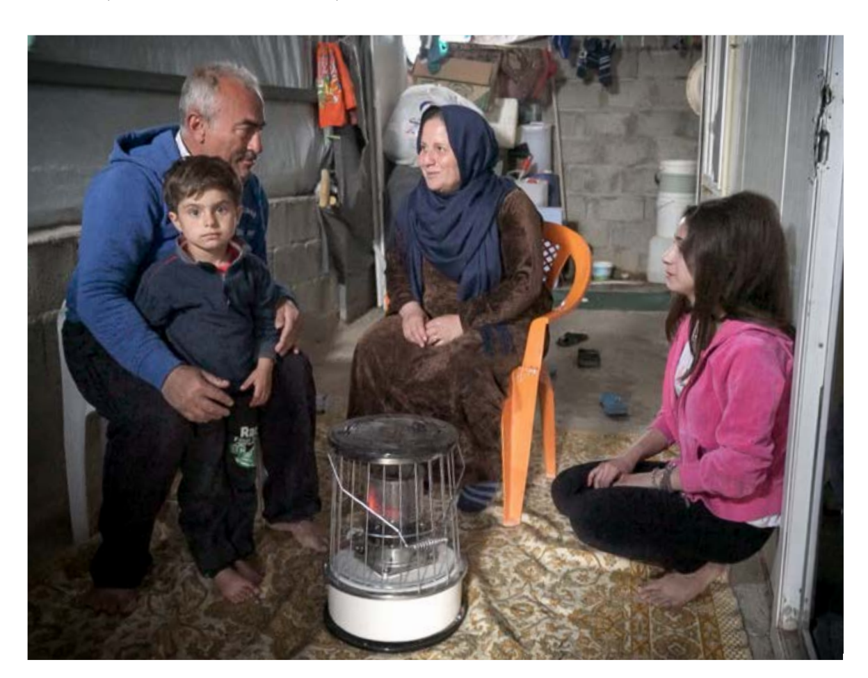
UN Women beneficiary, Basirma Camp, Kurdistan, Iraq.

In related terms, most countries in the region have ratified the Convention on the Elimination of All Forms of Discrimination Against Women (CEDAW), however, the obligations established by CEDAW have yet to be translated into comprehensive legislation or changes in social norms across most countries in the region.44 There is also an emerging trend of activists using General Recommendation 30 in their CEDAW shadow reports, such as in Yemen, Syria and Palestine, which have a long history of women's organisation, and have successfully engaged with CEDAW since its national ratification in 2003 (Syria), Yemen (2008), and 2015 (Palestine). Tunisia was the first country in the region to withdraw all its reservations to CEDAW. The decision was announced in 2011 and took effect in April 2014. The other Arab states without reservations to CEDAW are, Morocco and Palestine.