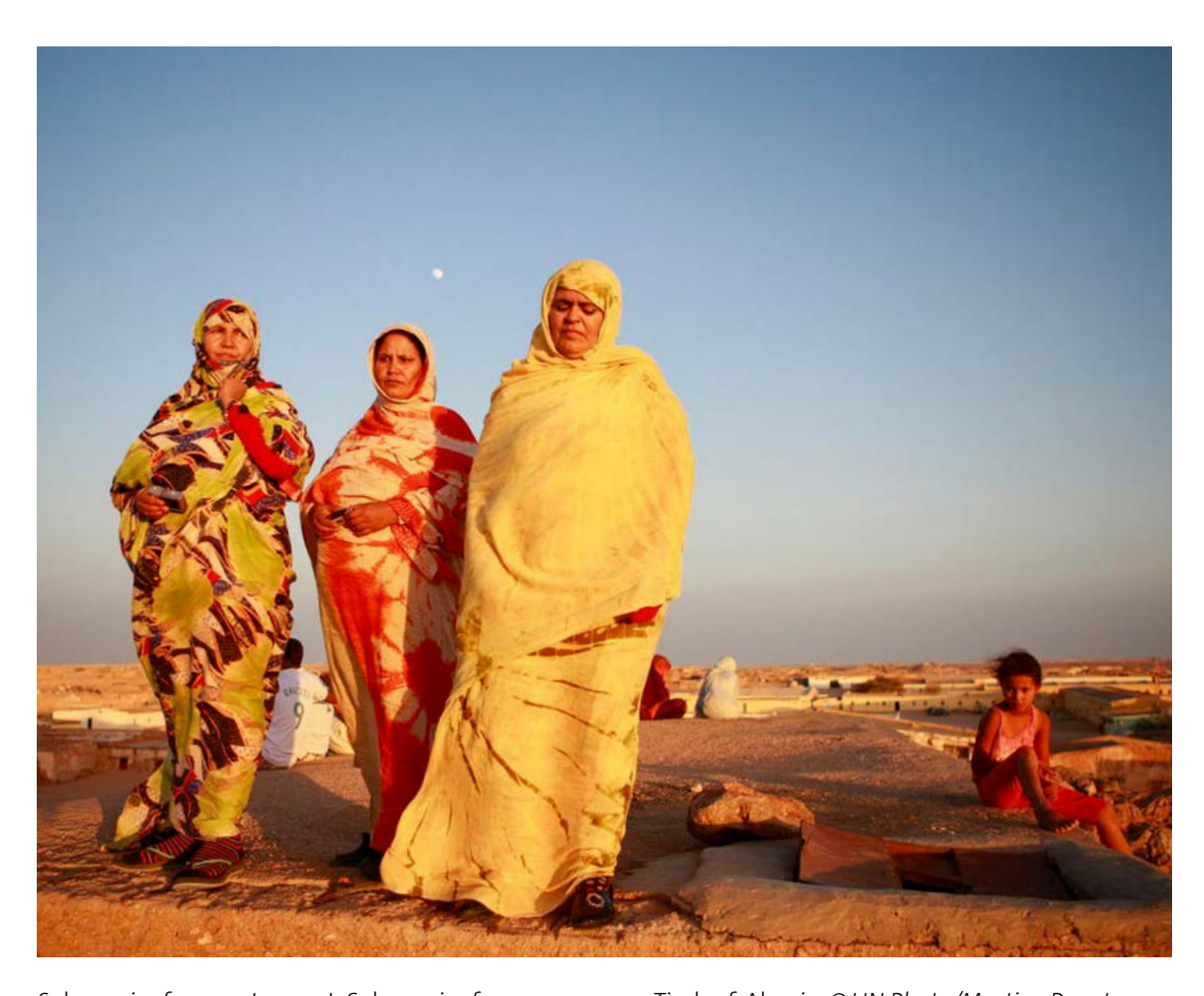
Saharawi refugees at sunset. Saharawi refugee camp near Tindouf, Algeria.

Discussions with WPS experts in the region also underscored the fact that diversity and difference are inevitable, necessary, and yet difficult to deal with: "on the one hand, this is healthy – good that there is space for them to disagree, but it is holding the movement back". As such, "having a space for feminist actors to communicate is critical - we need to support the feminist movement to exist" (regional WPS expert).