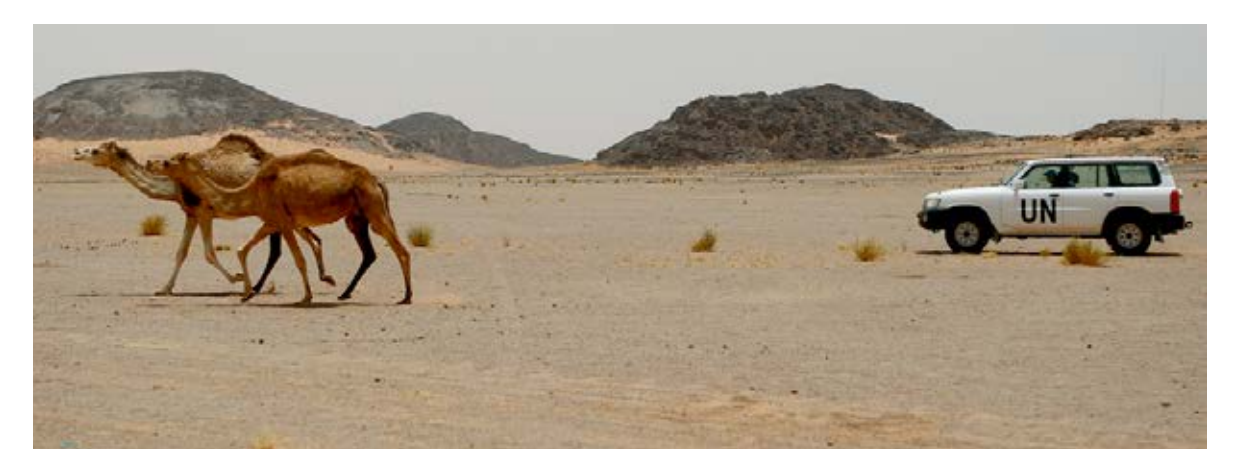
UN Mission for the Referendum in Western Sahara (MINURSO) conduct a ceasefire patrol near the border with Mauritania.